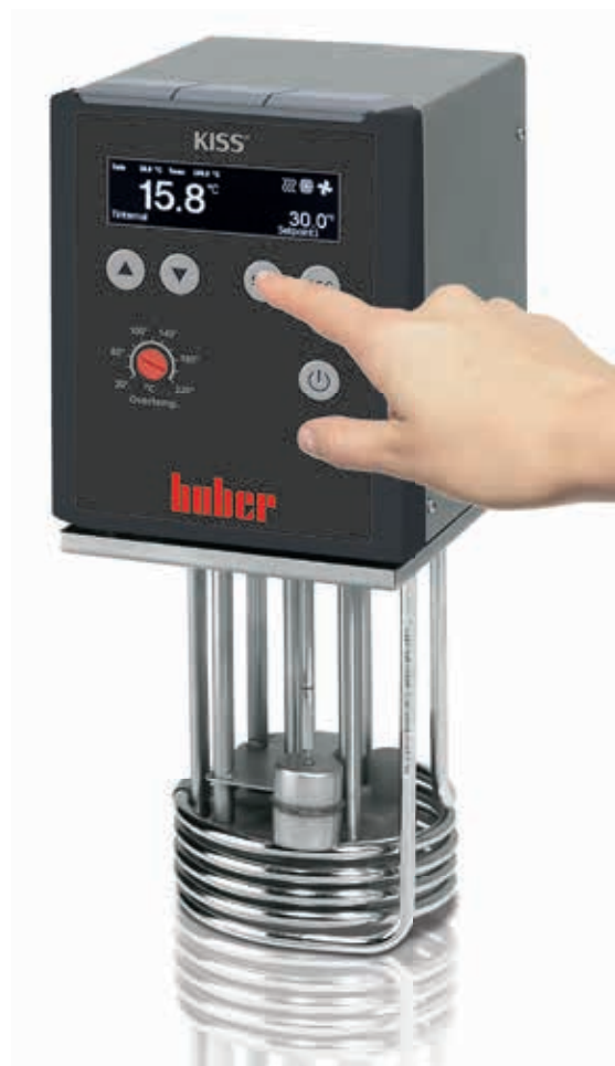
Fig. 2: The new OLED display shows all important data clearly: setpoint value, actual value, temperature limits as well as status of the pump, heating and cooling systems.

The KISS range comprises an immersion circulator with screw clamp as well as different baths. The baths are available either in transparent polycarbonate (up to +100 °C) or high-grade stainless steel (up to +200 °C). The filling volume of the baths is from 6 to 25 litres, depending on the model. For cooling applications we offer cooling circulators for working temperatures down to -30 °C. As standard, these models already work with natural refrigerants and are therefore friendly to