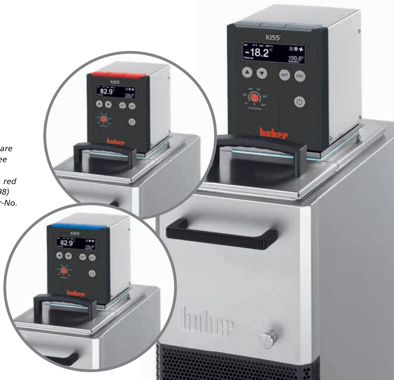
Fig. 5: KISS circulators are available in three colour options: grey (standard), red (Order-No. 61998) and blue (Order-No. 61999).

Furthermore, there is a free software for remote control, recording of measuring data and visualisation called „SpyLight“.