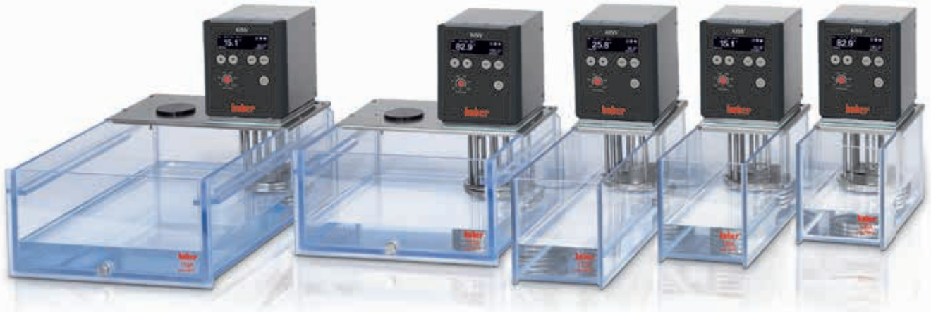
Fig. 4: KISS baths are available in transparent polycarbonate or stainless steel. The range of volumes is from 6 to 25 litres.

the environment and climate. Additionally, the cooling machines have an automatic cooling capacity adjustment that reduces the energy consumption and the waste heat to a minimum.